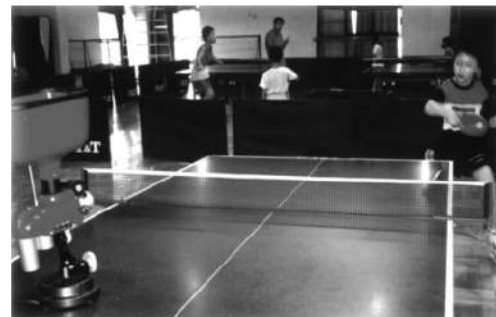
乒乓球发球机 Table tennis robot