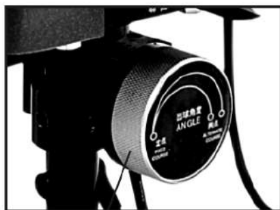
角度调节旋钮 Service angle adjustment knob

调整发球角度的时候，可通过“角度调整旋钮”进行调整，向右边旋时发出的角度就大，向左边旋时发出的角度就小，向左边旋到尽时发出的球是定点，可在运行中调整。