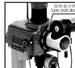
旋转锁紧旋钮 Spin locking knob

在选择旋转的时候，首先松开“旋转锁紧旋钮”，摆动机头手柄，按机头上的指示牌，选择您所需的旋转，对准三角标，然后将“旋转锁紧旋钮”锁紧便可，机头可正反360度旋转，需要注意因机头的电线与机身相连，小心不要拉得太紧，以免拉断。