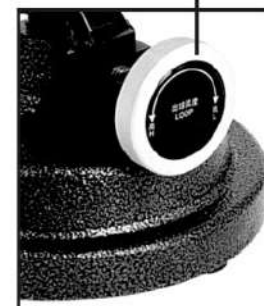
弧度调节旋钮 Loop adjustment knob

发球机的发球形式分为直发式和间发式，直发式发出的球旋转、速度都比间发式稍强，调整过程同选择出球弧度一样，使用“弧度调节旋钮”来进行，向左边旋时，出球口向上，向右边旋时，出球口向下，可在运行中调整。