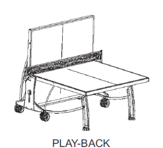
Norme EN 14468-1 (classe C) 152,5 cm 274 cm